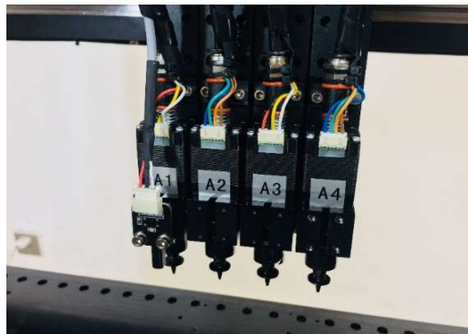
New Z-axis sensor included to measure pickup height