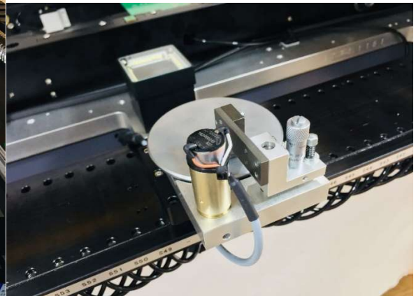
Optional dipping station

Optional SMEMA compatible connectors for synchronisation on input and output side!